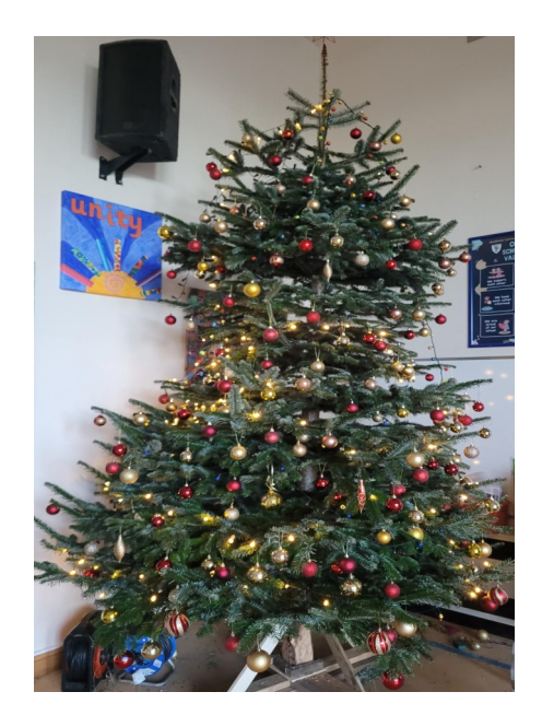
We hope you liked our fabulous Christmas tree which was once again purchased from the Gelsmoor Christmas Tree Farm.