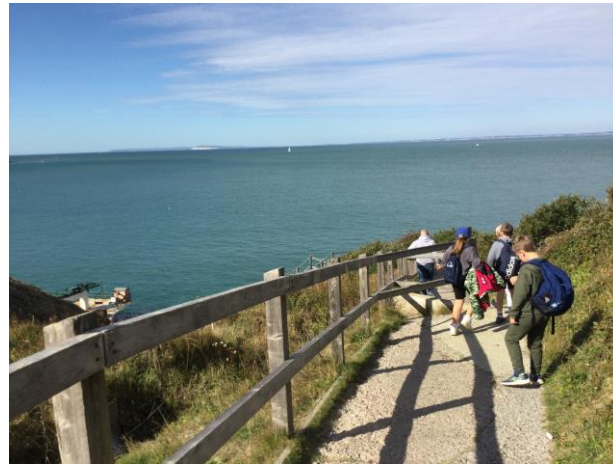
Day 2: The Needles, Robin Hill and Crazy Golf