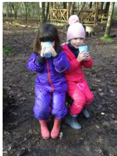
Forest School uniform

It would be beneficial to the children if they are able to dress and undress themselves for P.E. lessons. P.E. kits need to be in School on a Monday and left for the week. Please feel free to take home on a Friday for a good wash!