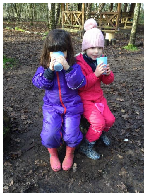
Forest School uniform

It would be beneficial to the children if they are able to dress and undress themselves for P.E. lessons. P.E. kits need to be in School on a Monday and left for the week. Please feel free to take home on a Friday for a good wash!